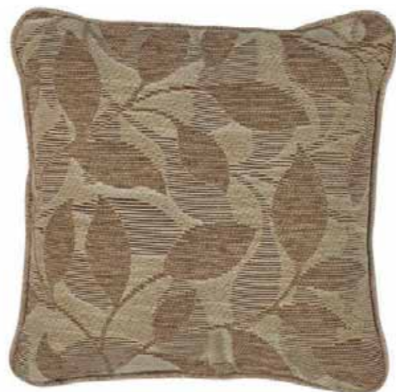
Shadow Leaf - Champagne (P)