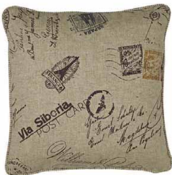
Poste - Mustard (P)