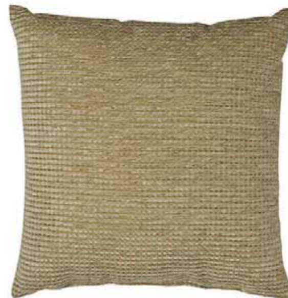
Egypt - Champagne (D)