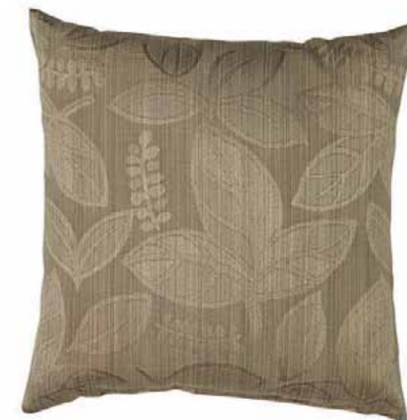
Monmouth - Beige (D)