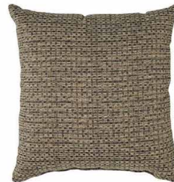
Sandbach - Mocha (D)