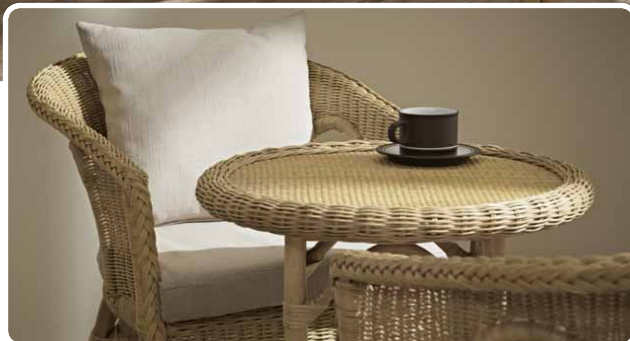
Highgrove Bistro Set