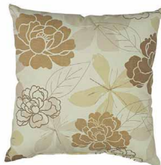
Sunningdale - Natural (D)