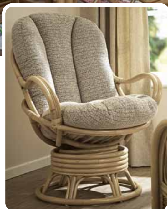
Swivel Rocker Chair

Scatter cushions not included. Some self-assembly may be required.