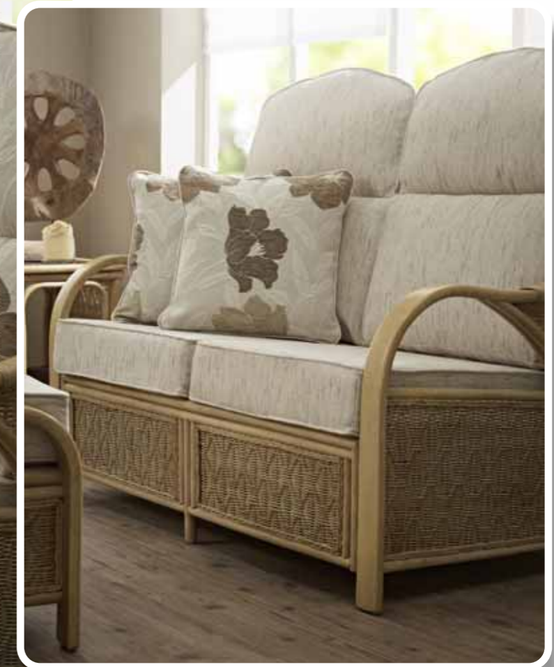
Showing Reversible Cushion Option