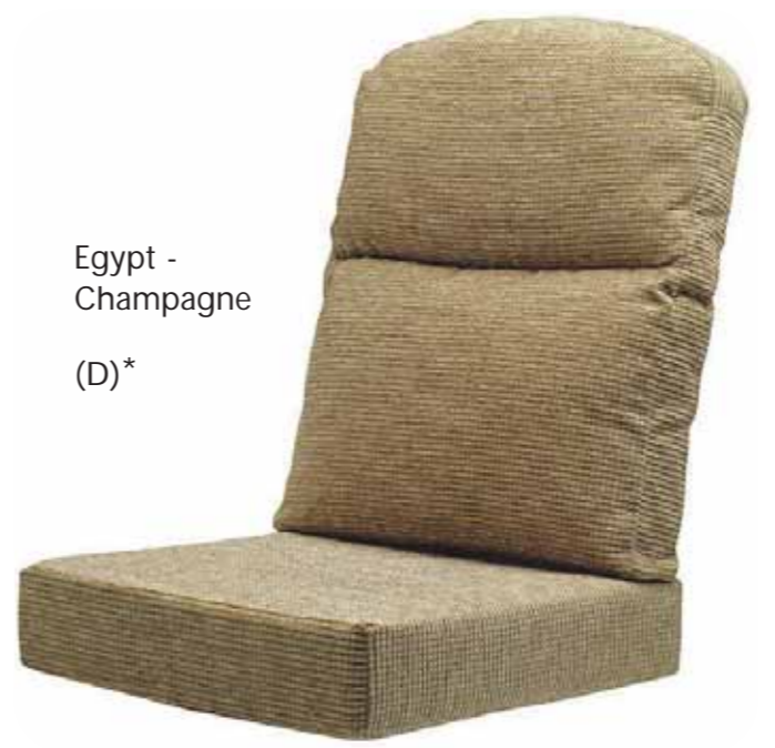
Egypt - Champagne (D)*