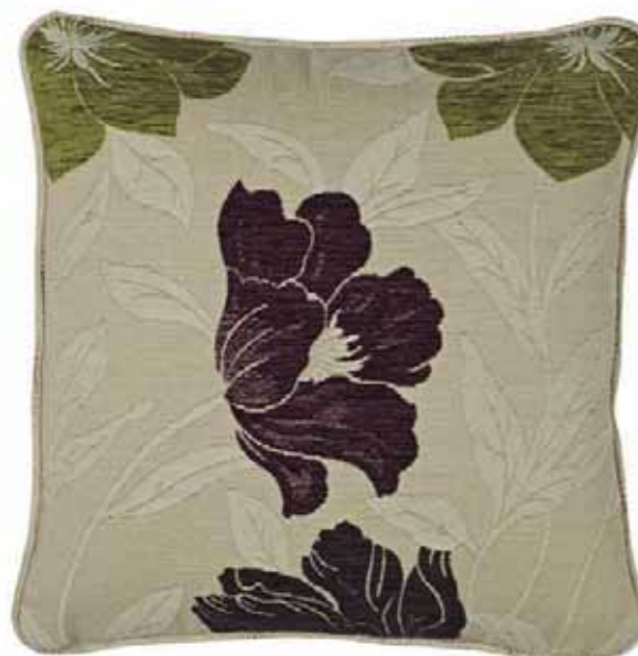
Santa Fe - Aubergine (P)