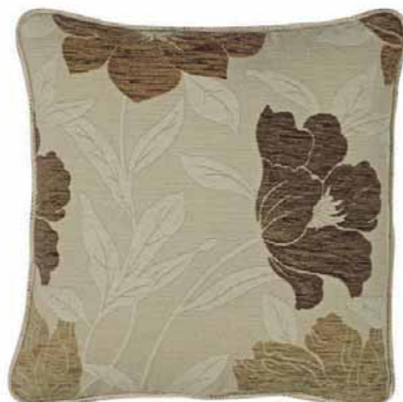
Santa Fe - Natural (P)