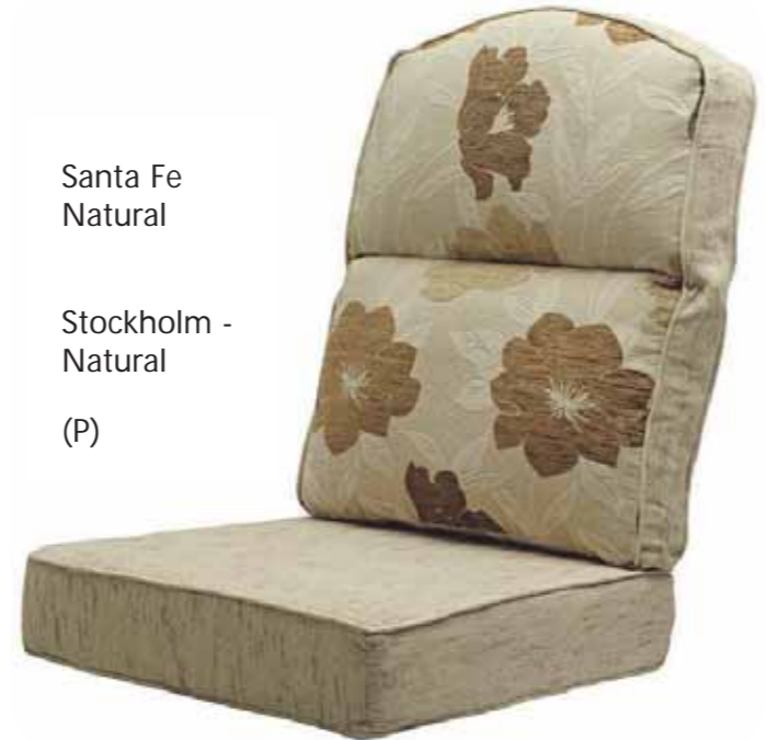
Santa Fe Natural Stockholm - Natural (P)