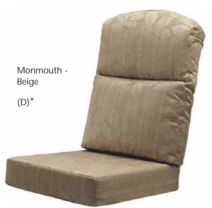
Monmouth - Beige (D)*