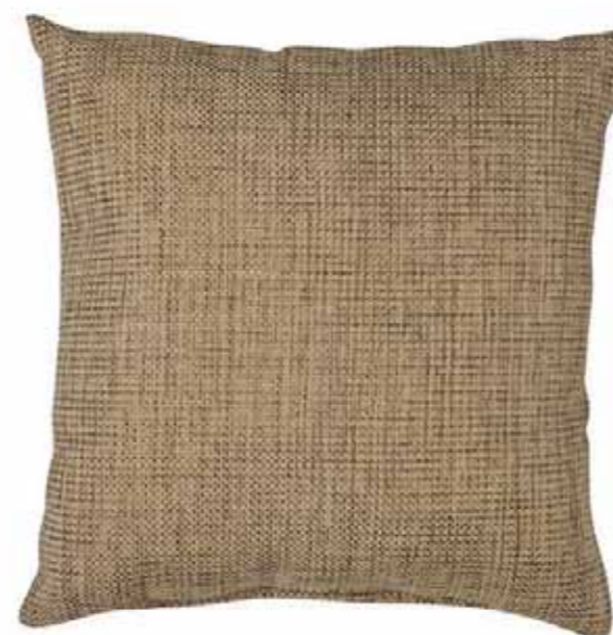
Modena - Latte (D)