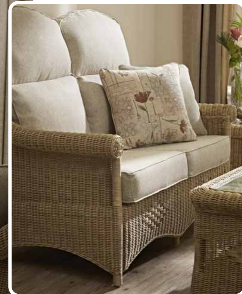
Showing Reversible Cushion Option