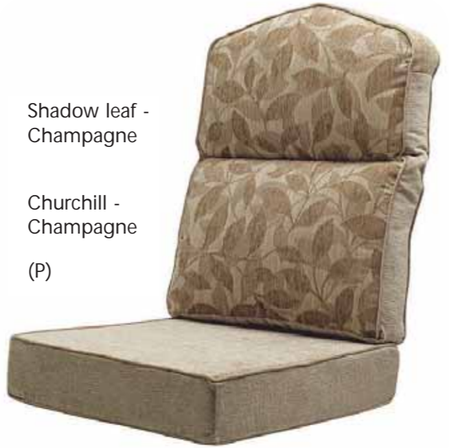
Shadow leaf - Champagne