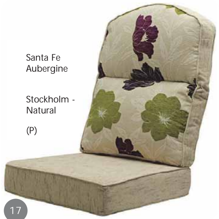
Santa Fe Aubergine Stockholm - Natural (P)