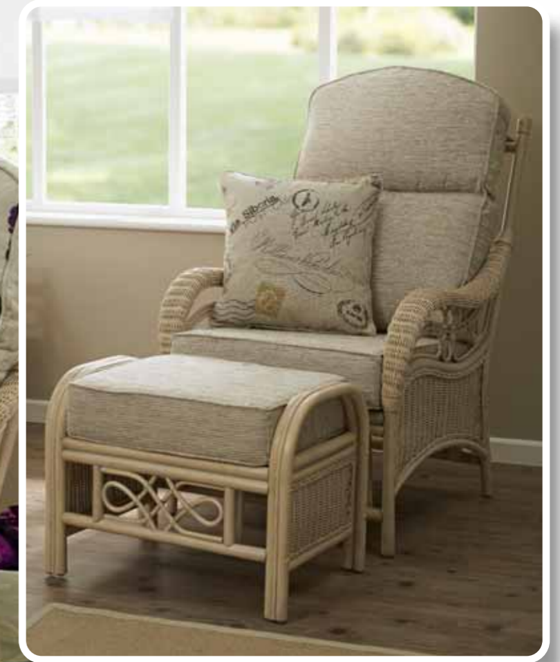
Showing Reversible Cushion Option