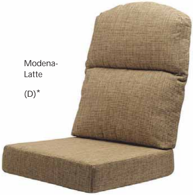
Modena - Latte (D)*