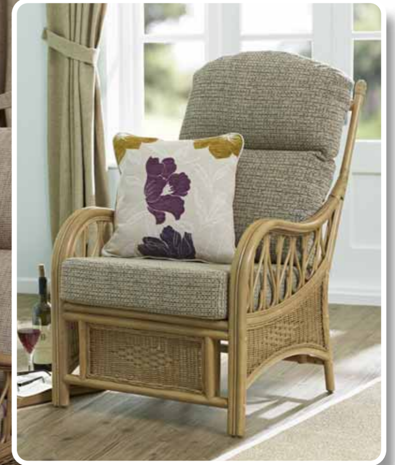
Ivory Wash Colour Fame