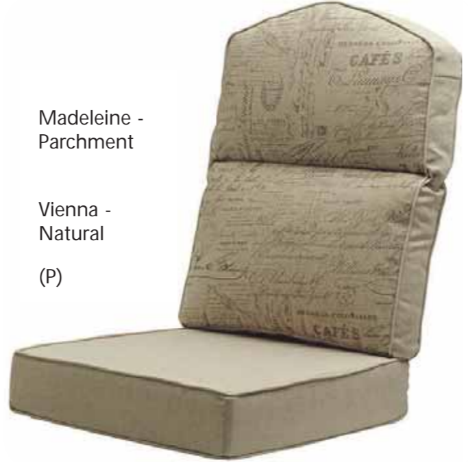
Madeleine - Parchment Vienna - Natural (P)