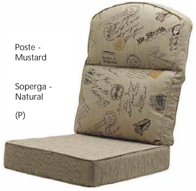
Poste - Mustard Soperga - Natural (P)