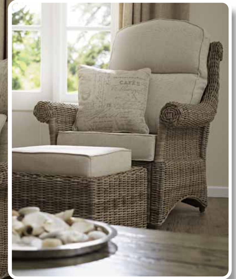
Showing Reversible Cushion Option