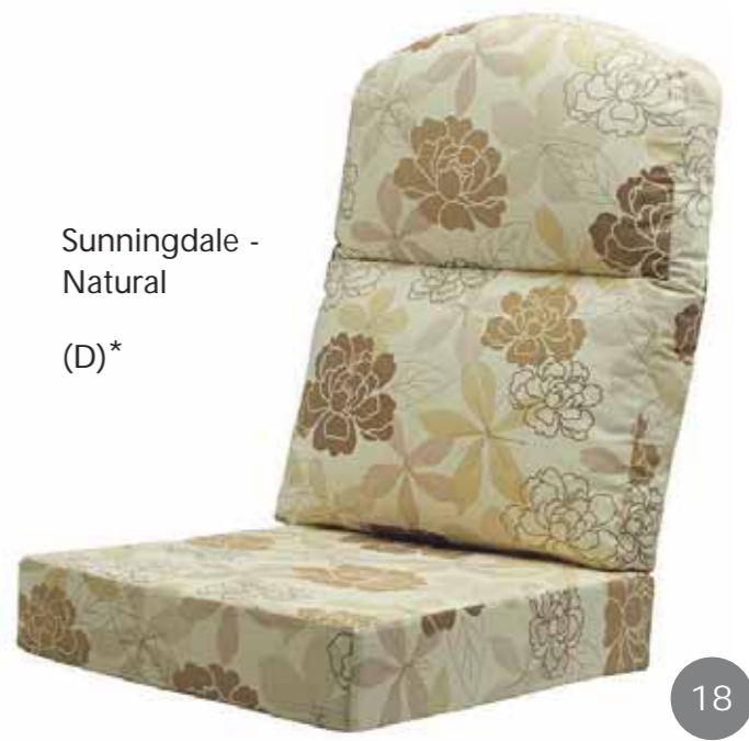
Sunningdale - Natural (D)*