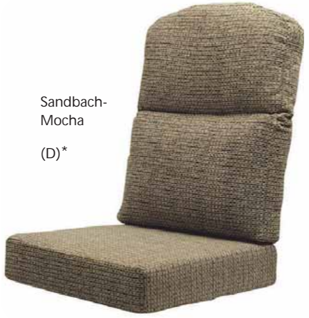
Sandbach - Mocha (D)*