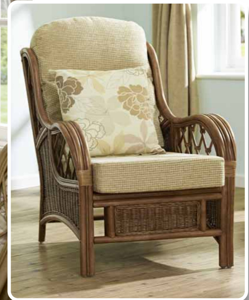
Brown Wash Colour Fame