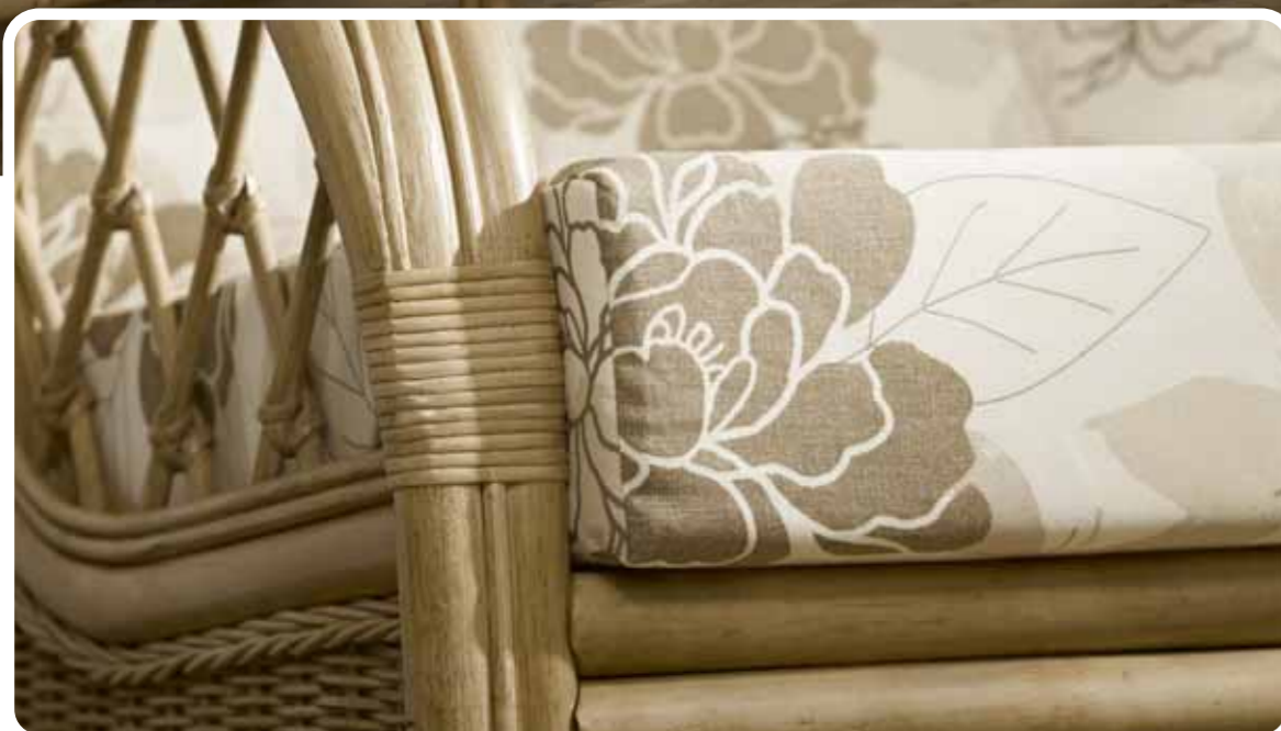
Natural Wash Colour Fame